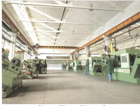
Shop Floor Plant 2