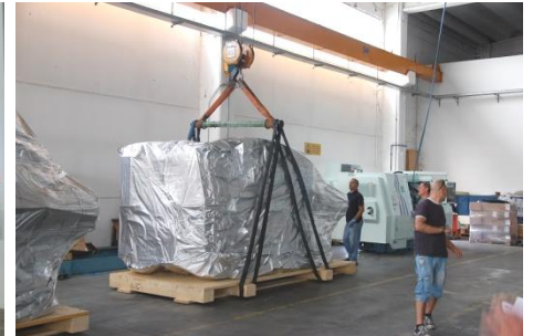
Trofeo machines wrapped for shipment