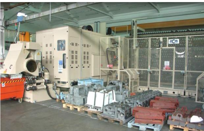
FMS System from MCM utilizing horizontal centers with pallet pool