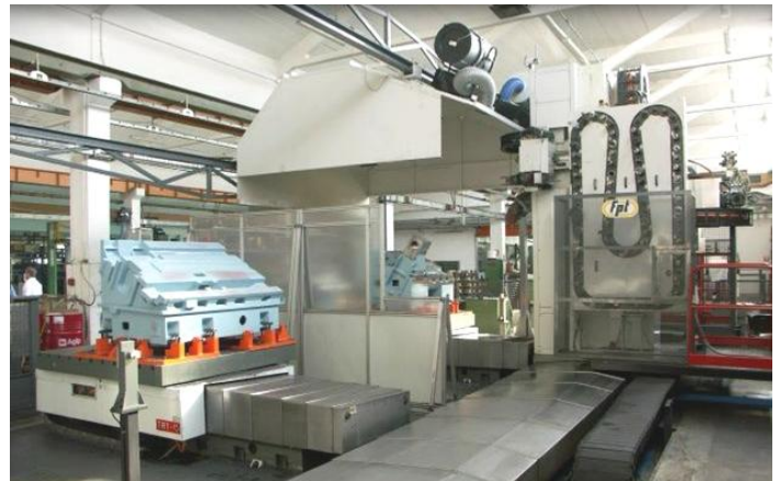
FPT universal does 5-sided machining of a machine base

We don't just assemble the machines, we make them! ...from pouring the castings, machining the castings, making our own turrets, to painting the machines.