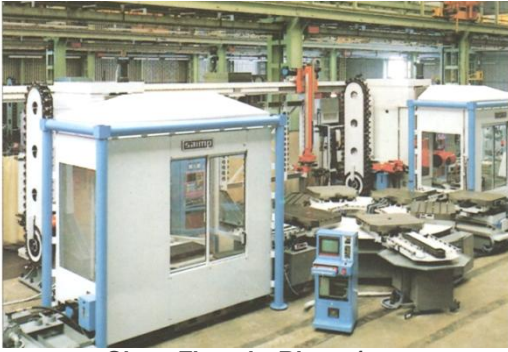
Shop Floor in Plant 1