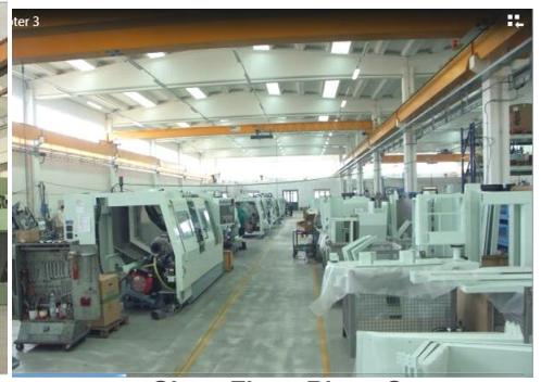
Shop Floor Plant 3