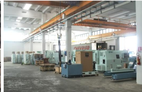
Single turret machines prepped for crating